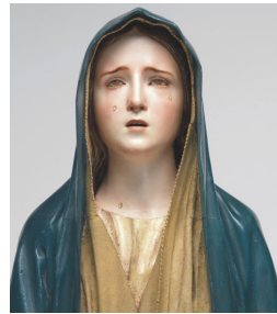
The heartbreak of loss seems intensely captured in this statue by Pedro da Mena, made c.1525 from wood, with glass beads for tears. Fitzwilliam Museum Cambridge.