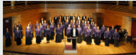
The English Arts Chorale at the Menuhin Hall